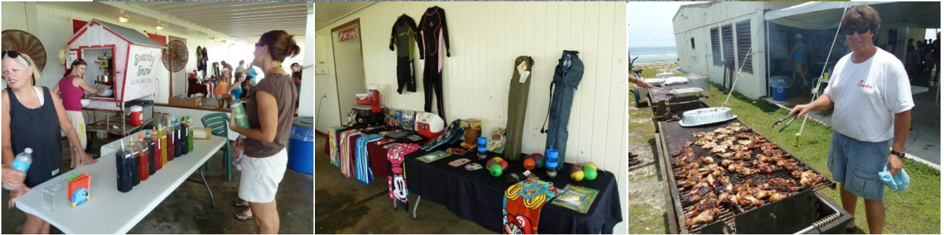
Splash-for-Trash